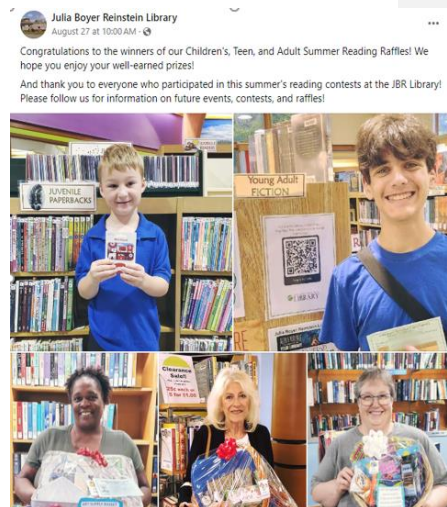
Julia Boyer Reinstein Library

August 27 at 10:00 AM Congratulations to the winners of our Children's, Teen, and Adult Summer Reading Raffles! We hope you enjoy your well-earned prizes! And thank you to everyone who participated in this summer's reading contests at the JBR Library! Please follow us for information on future events, contests, and raffles!